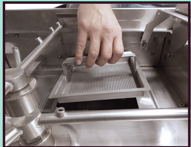
Interchangeable Scrap Baskets