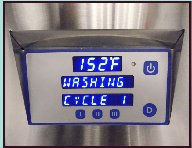
Digital LED Control Panel

Ease of serviceability is important to Jackson, and with that in mind, the DynaStar was designed to utilize common Jackson parts, as well as making service access easy. All service parts can be accessed while the unit is in place - no need to pull it from the wall or disconnect tables.